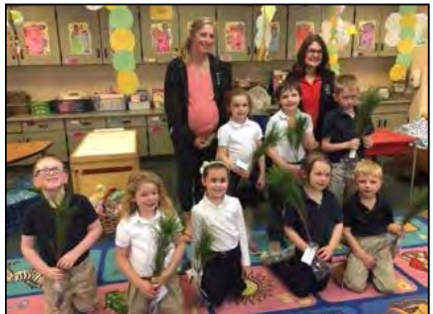
Below: Kindergarten students at Jordan Elementary School pose with their new Norway Pine trees.