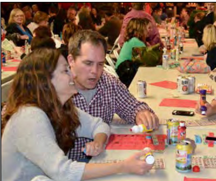
Below Left: Participants enjoy a night of relaxation and fun!